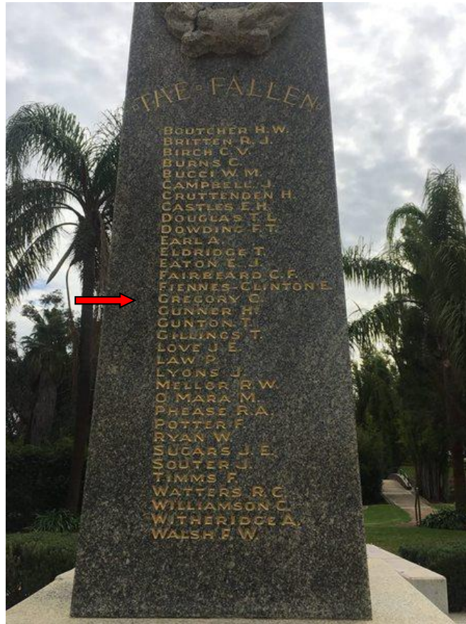
Belmont War Memorial