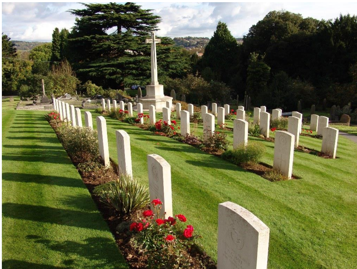
War Graves in Locksbrook Cemetery, Bath

The licence having been readily accorded, the Corporation has now carried their promise into effect,.....”