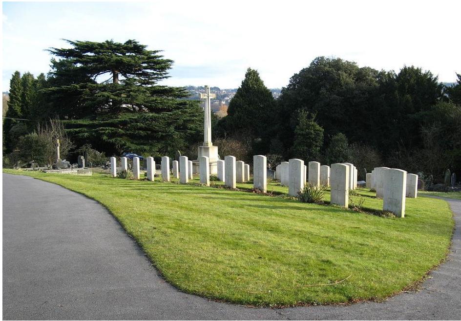
World War 1 War Graves in Locksbrook Cemetery, Bath